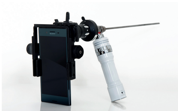
Figure 1: Mobile hysteroscope

The uterine model used in our study is a human uterus extracted after hysterectomy. The uteri are transferred after the operation for gross examination to the pathology department, in special containers labelled with patient information, without formalin or any solution. At Around 12:00 noon on average three or four specimens are available and we transport them to a special lab where we perform a hysteroscopy as described.