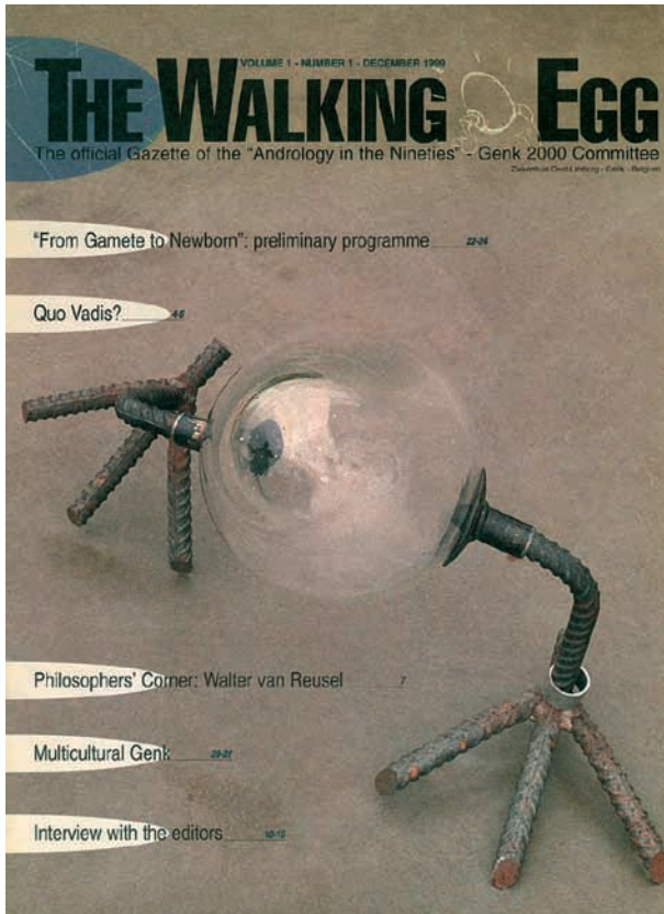
Fig. 1. — First issue of the international magazine “The Walking Egg”, published in March 2000.