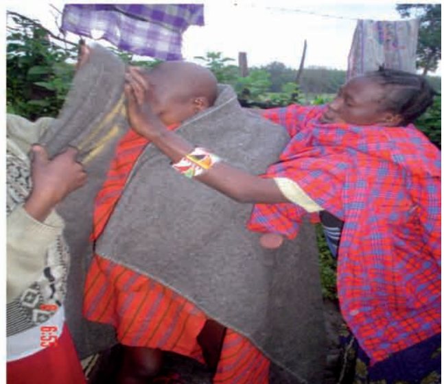
Fig. 4. — Time series pictures showing the progression of the witnessed circumcision ceremony from the beginning to the end.