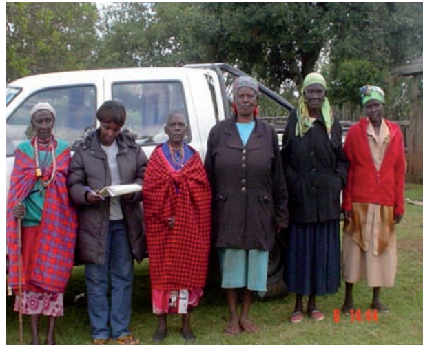
Fig. 2. — A group of women after a focus group discussion. Research assistant (second left).

A convenient sample consisting of 28 women was recruited from the area's general population. The sample was varied in terms of age (15 to 80 years), educational background (different levels of literacy), and vocation (housewives, farmers, traders, professional teachers, traditional birth attendants, traditional circumcisers, etc). Such variation was necessary to guarantee a more balanced perspective concerning the subject. A small number of men (19) were also selected with a view to access the male perspective regarding the same. Although most participants championed the right of the community to preserve the ritual and practice of FC, they were all exposed to the ongoing national discourses concerning FC and were indeed aware of the FGC eradication campaign. They thus had the benefit of insight from both sides of the ensuing cultural debate.