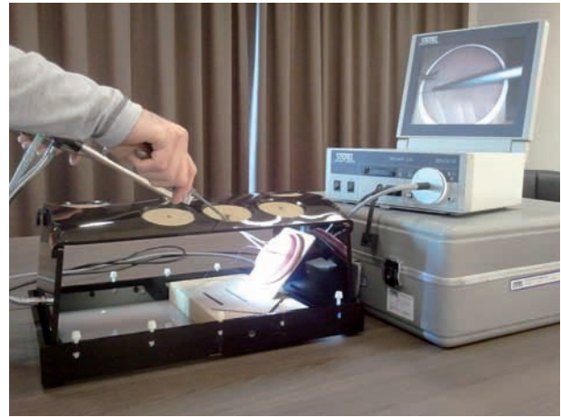
Fig. 3. — The Suturing and knot tying Training and Testing model (SUTT).