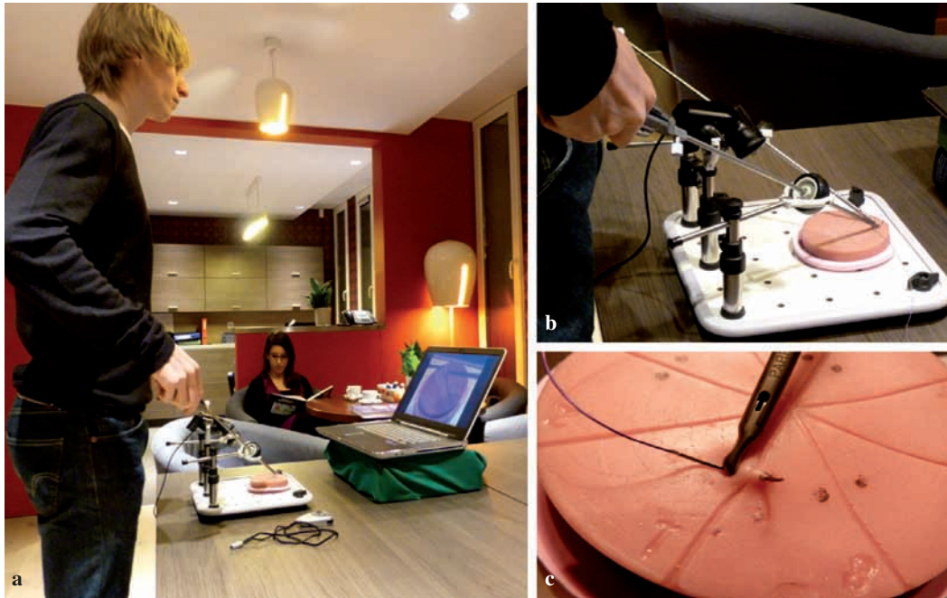
Fig. 4. — “E-Knot “. The easy home trainer a. Student training suturing skills at home. b. E-Knot with camera connected to notebook. c. Suturing pad with 8 different stitching directions.