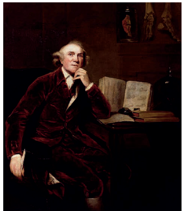
Fig. 3. — John Hunter wrote the first report of artificial insemination in medical literature in 1790.