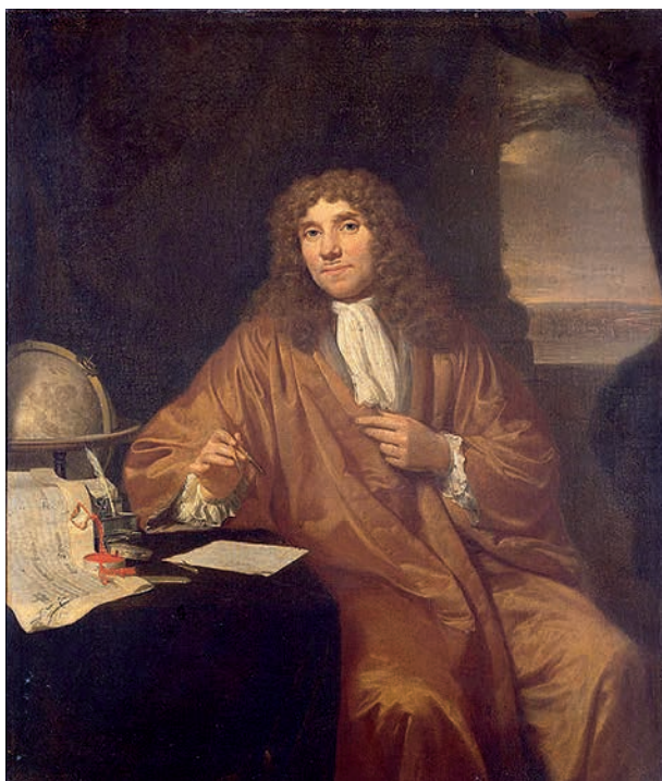
Fig. 1. — Picture of Antoni van Leeuwenhoek (1632-1723).

The first documented application of artificial insemination in human was done in London in the 1770s by John Hunter , which has been called in medical history the “the founder of scientific