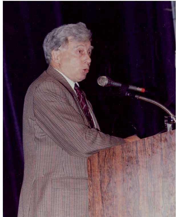
Fig. 6. — Bob Edwards: IVF pioneer and winner of the 2010 Nobel Prize in Physiology or Medicine (speaker at the “Andrology in the Nineties” meeting in Genk, 1995).

As a result of this research, the first successful human pregnancy with frozen spermatozoa was reported in 1953. Considering the hostile climate for DI at the time (the Cook County Supreme Court ruled that artificial insemination with donor semen was contrary to public policy and good morals) it is not surprising that nearly a decade passed before the first successful birth from frozen sperm