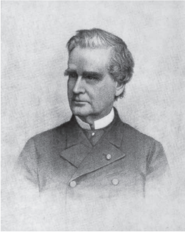
Fig. 4. — The first report of post-coital tests and the first description of 55 inseminations was done by JM Simms (US) in the 1850s (Source: South Med J, Lippincott, Williams & Wilkins 2004).

surgery”. A cloth merchant with severe hypospadias was advised to collect the semen (which escaped during coitus) in a warmed syringe and inject the sample into the vagina.