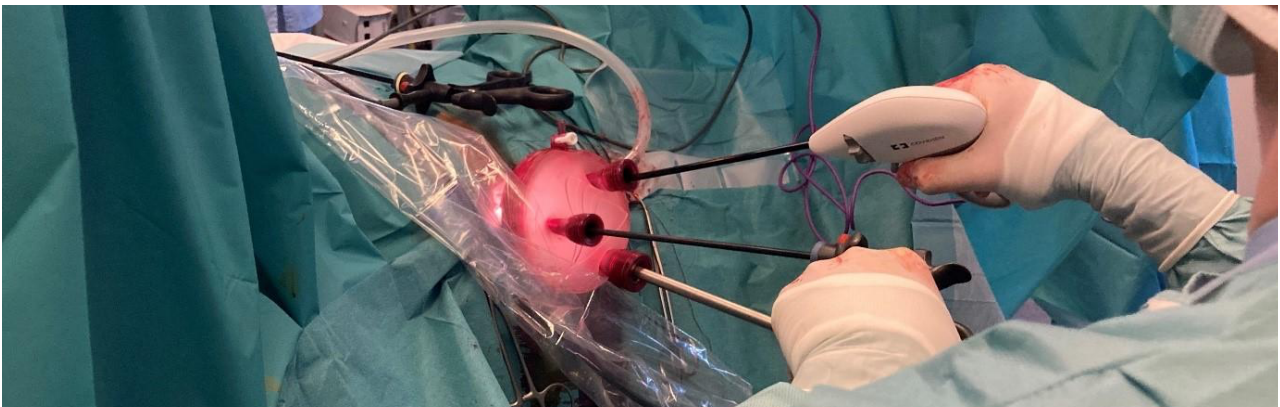
Figure 1: Surgeon performing a hysterectomy with the V-NOTES port.

The demographic and clinical characteristics of the 32 patients are shown in Table I. The results are