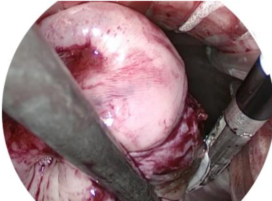
Figure 2: Coagulation the uterine vessels transperitoneally under visual control.